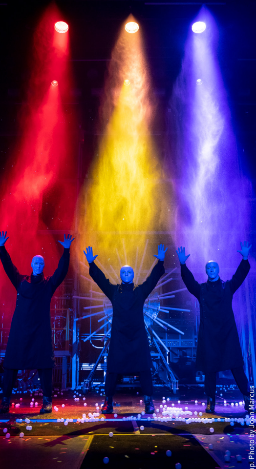
Blue Man Group.