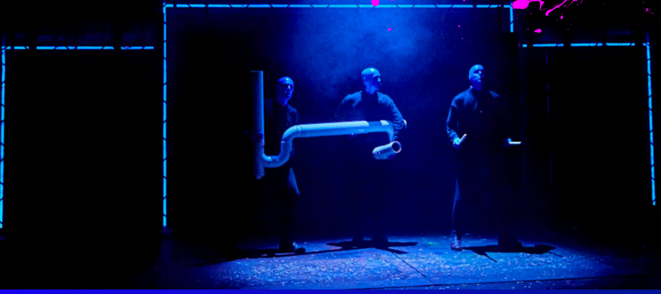
Blue Man Group.