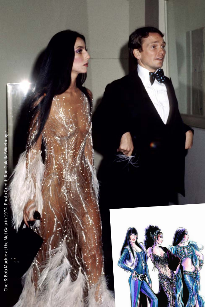
Mackie's sketches for three different eras across Cher's life.

Additionally, he has won 9 Emmy Awards and 1 Honorary Emmy Award for his television work.